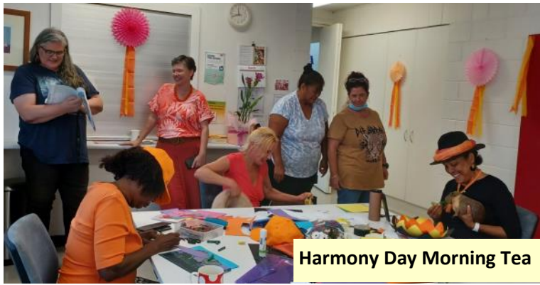
Harmony Day Morning Tea