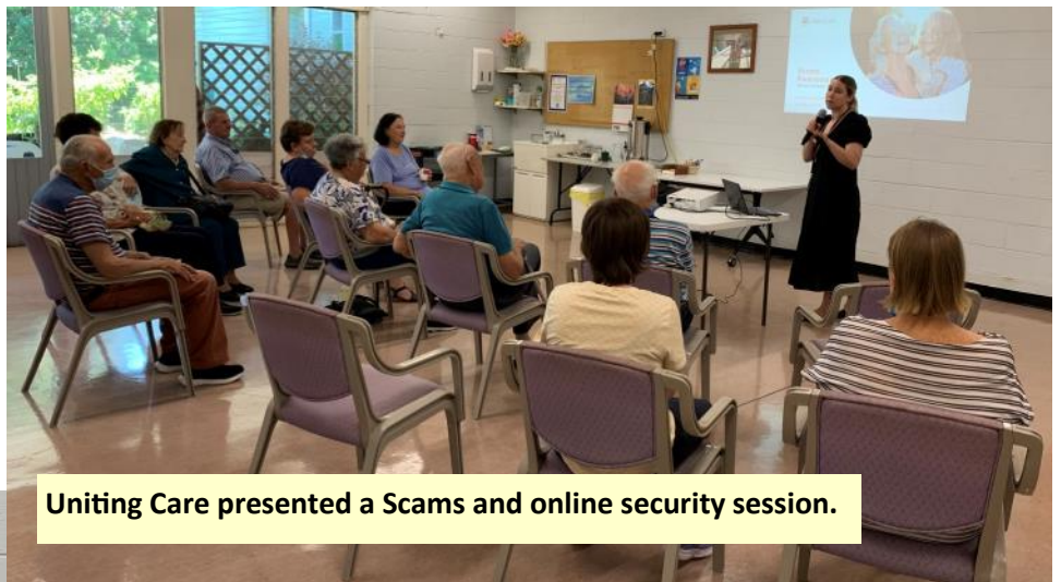
Uniting Care presented a Scams and online security session.