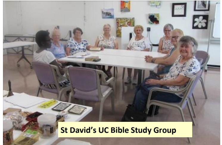
St David's UC Bible Study Group