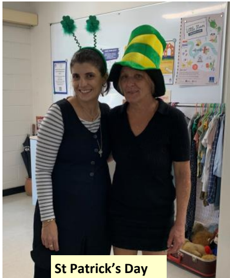
St Patrick's Day